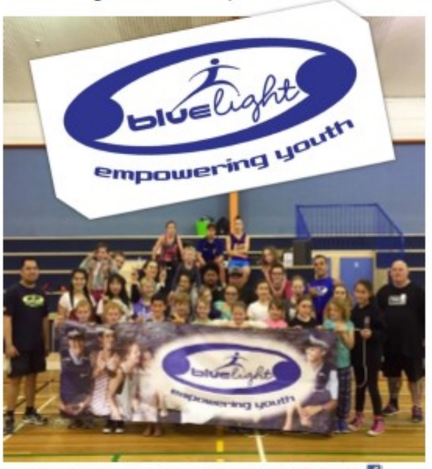
FOR MORE INFO SEE US ON FACEBOOK @ WAIHI BLUELIGHT VENTURES