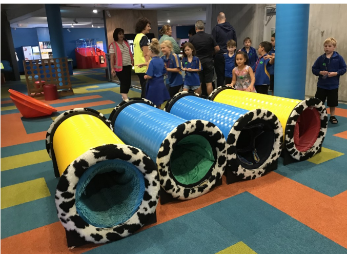
Year 3 & 4 Hamilton Museum Trip Surf n Turf Day 1