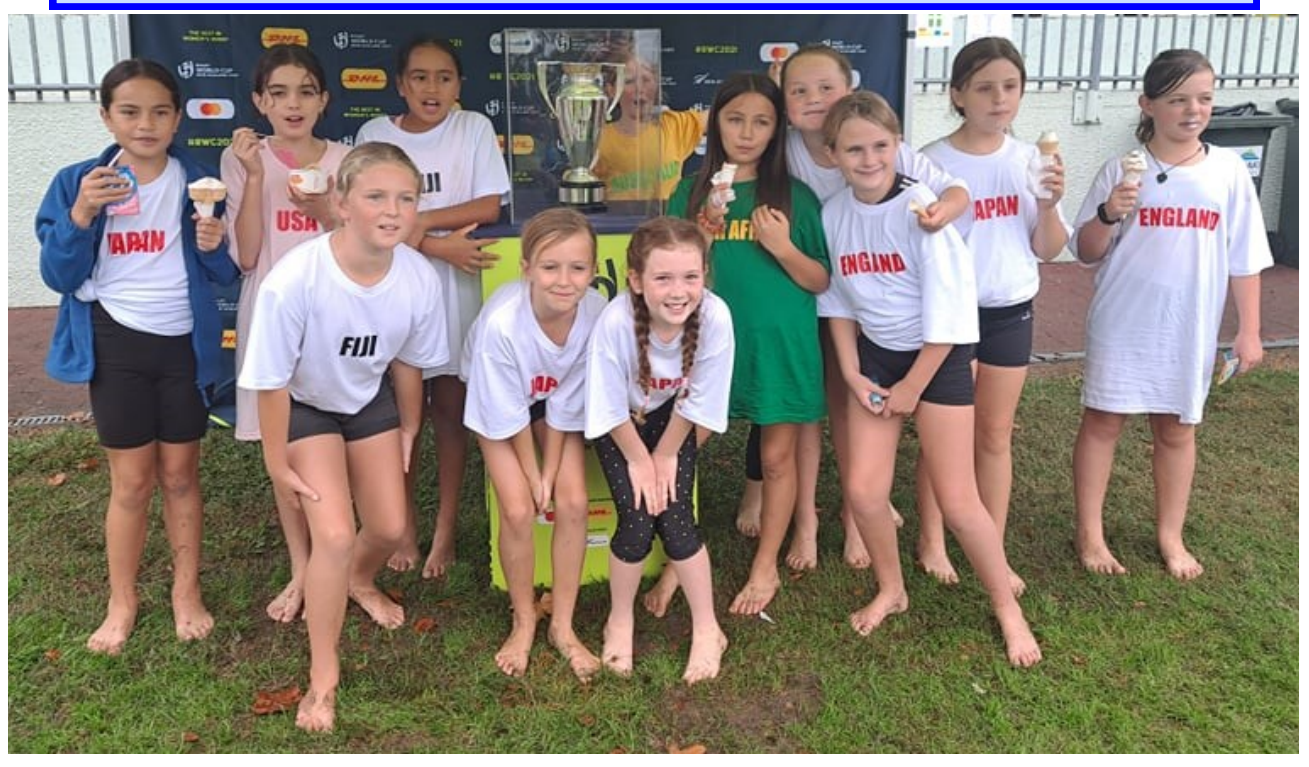
Girls Rippa Day. Black Ferns World Cup Tour Have A Go Day.