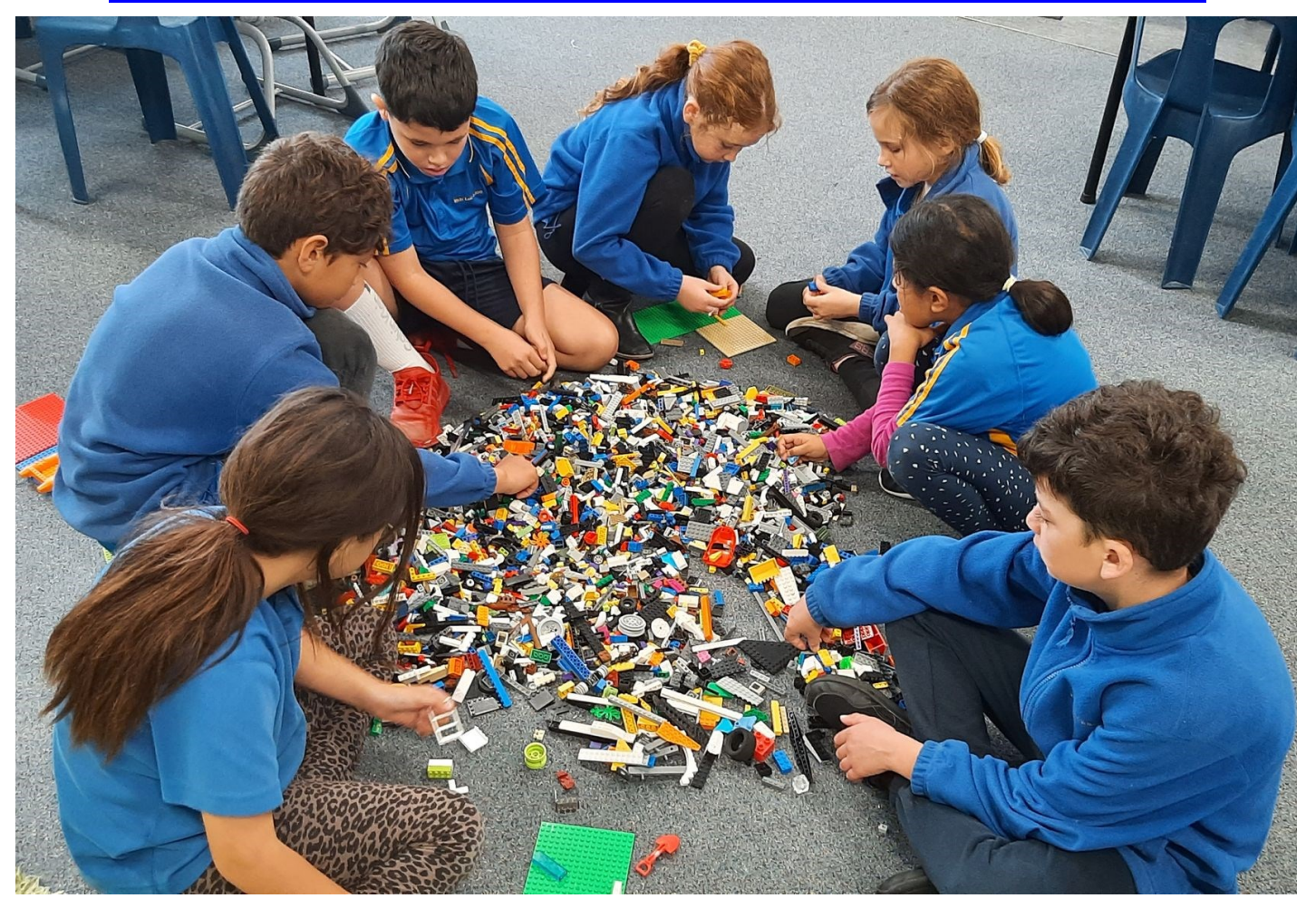
Wet lunch times. Yah for Lego!