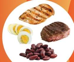
Meat and meat alternatives