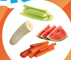
Vegetables and fruit