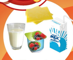
Milk and milk products