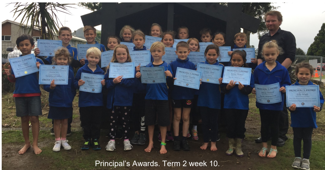
Principal's Awards. Term 2 week 10.