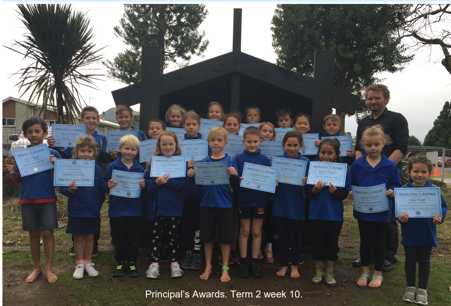
Principal's Awards: Term 2 week 10.

Waihi East Primary School Newsletter Term 3 Week 1 26 July 2019