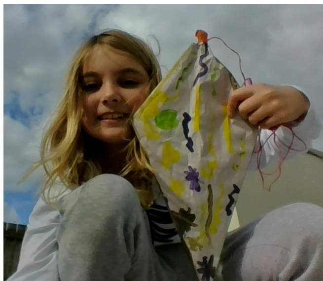
Fly a Kite Day