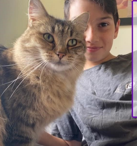
This is my cat vee vee, she sleeps on my bed at night and keeps me company.