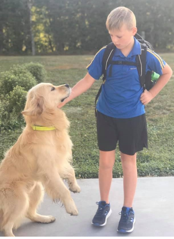
Virtual Pet Day Photos.