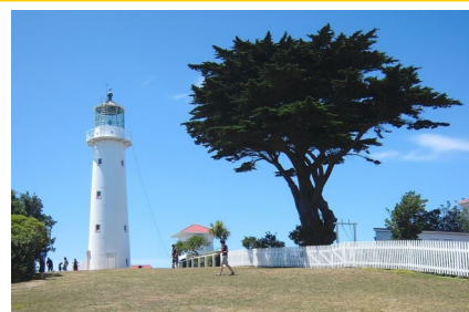
Tiritiri Matangi Island