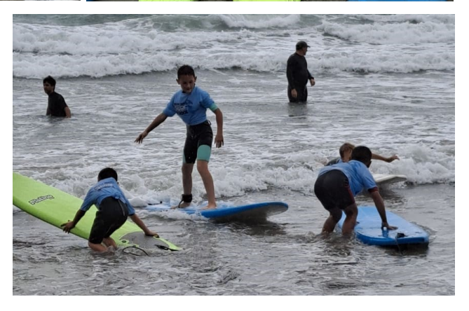
Surfing, Gold Discovery Centre & Games in the hall