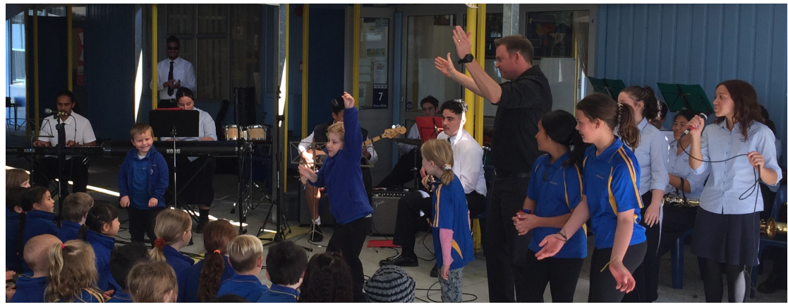
Friday afternoon Whare tapa wha rotations Supporting wellbeing—working together Collaborative games and problem solving