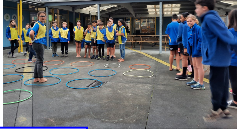
Human Connect Four