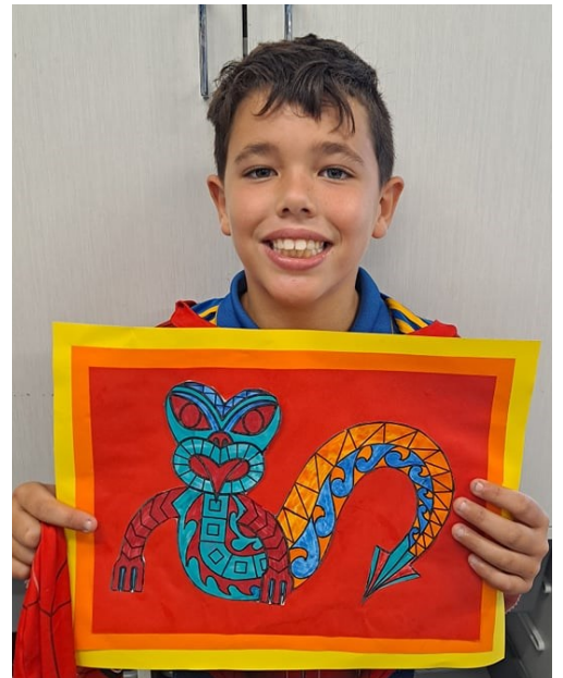
More Art Work from Room 1