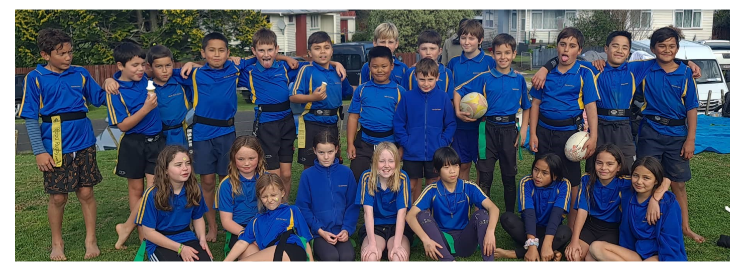
Below; Rippa Tournament