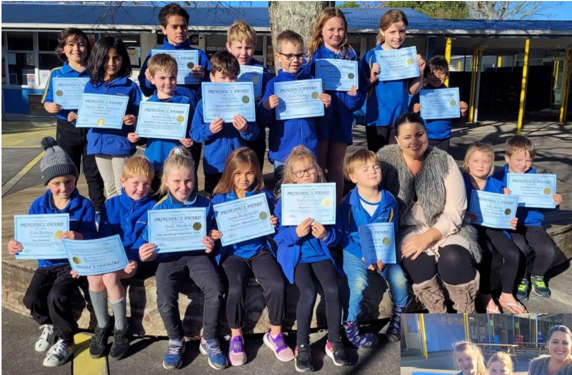
Principal's Awards Term 2