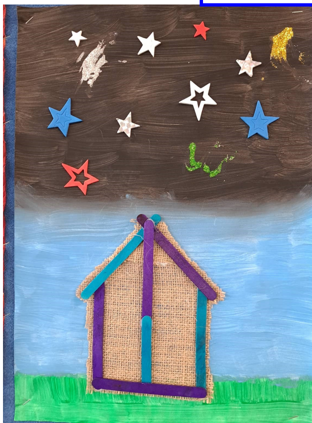
Holly M, Rm 1, age 8