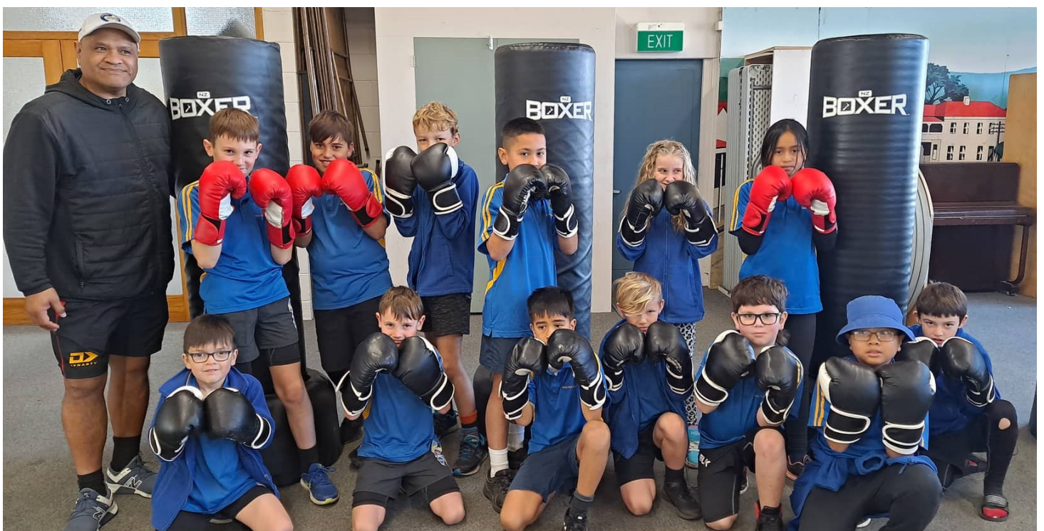
Electives Boxing Group