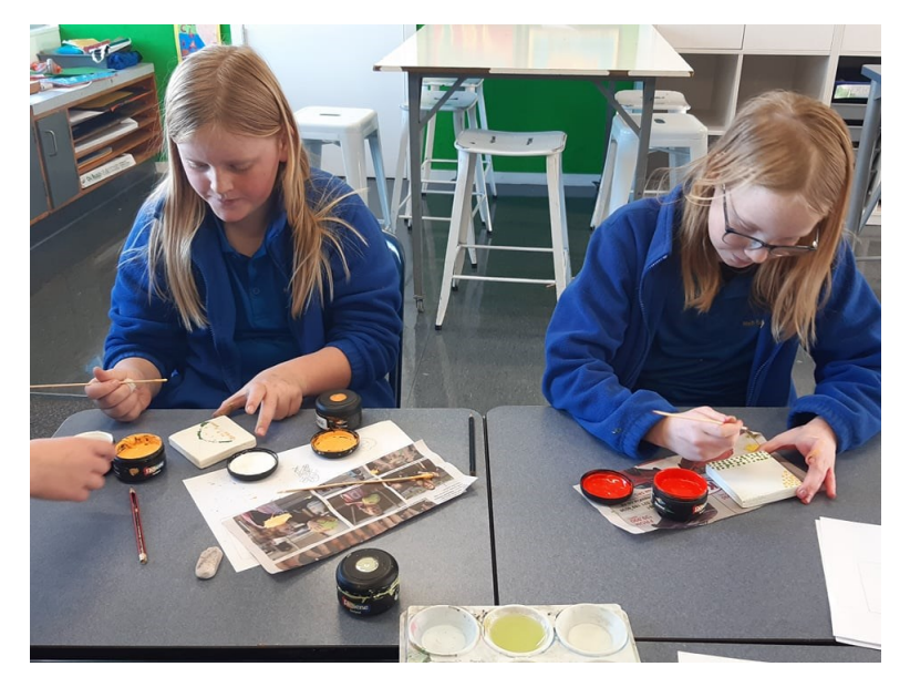
Electives Art Group