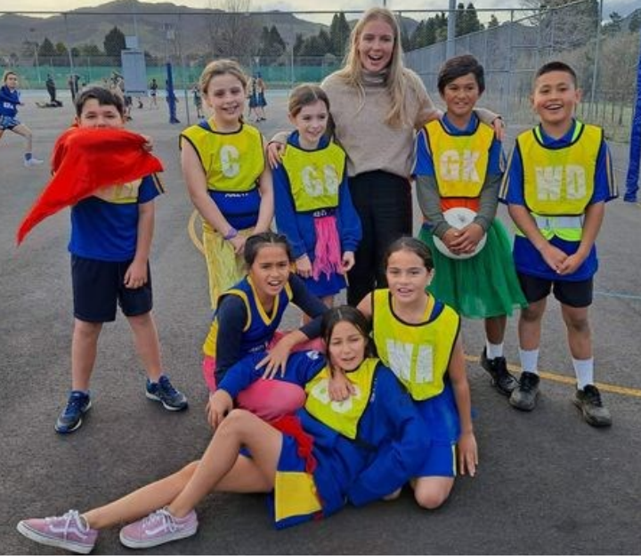
Closing day Year 5/6 Netball.

If you live in the home zone and have not yet signaled your intention to enroll your child later this year, please contact the school immediately to assist us to plan appropriately.