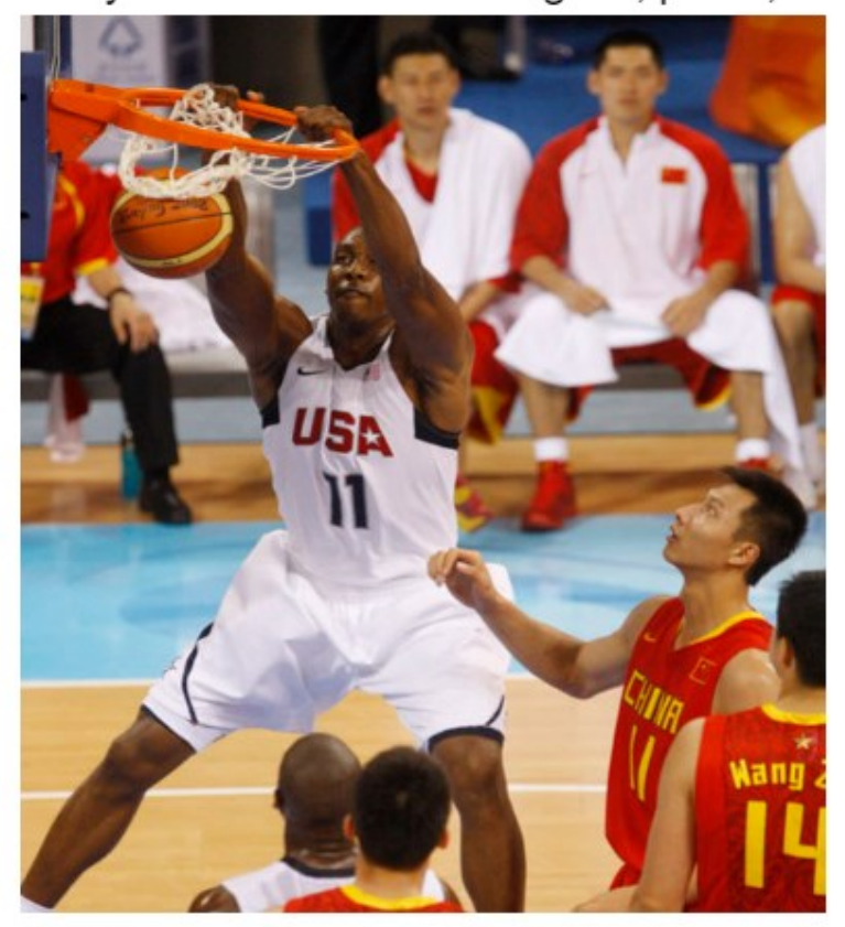
Raising funds for new basketball hoops!

Wear any kind of basketball singlets, pants, shoes