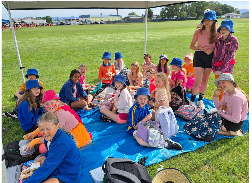
Colour FUN RUN