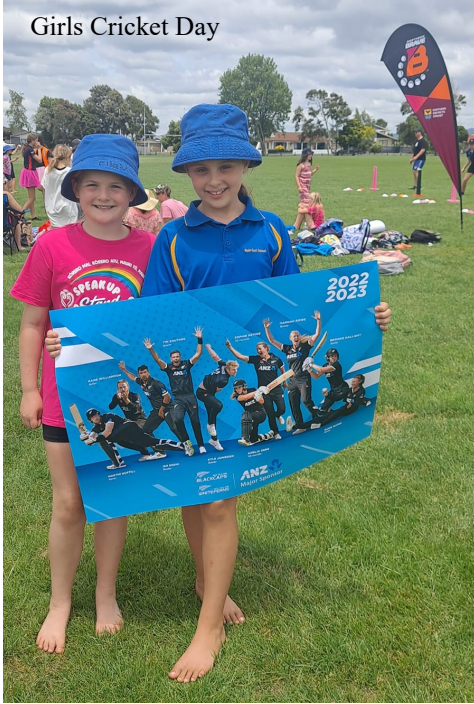
Girls Cricket Day