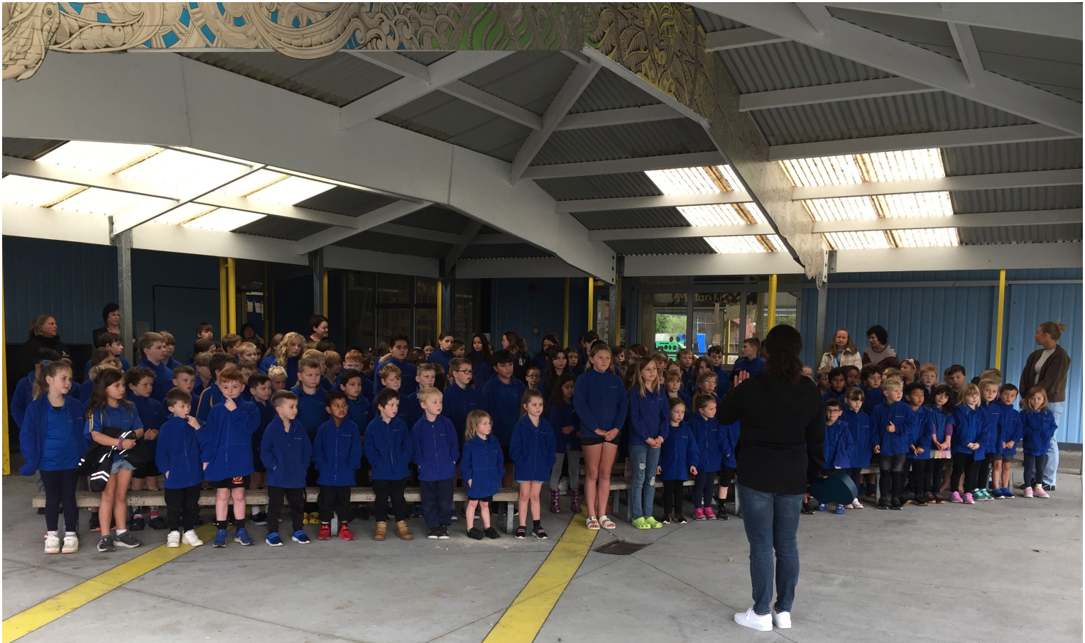
Paepae Time Week One Term 3.