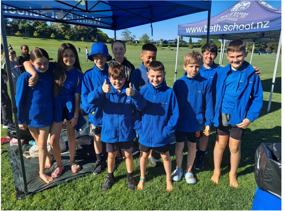
2023 Year 5 & 6 athletes at North Cluster Athletics