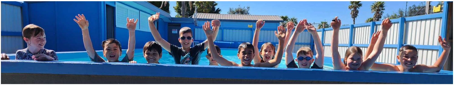
Yah!!! The pool is open for swimming!