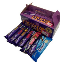
Cadbury BLOCKS BOX 36 Pack 45g - 60g $2.00 RRP x 6 Carry Packs

This Blocks Box includes the best sellers from the Cadbury Dairy Milk Range 45g-60g! At $2 these make selling easy with just one coin required!