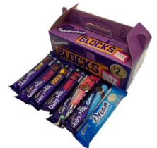
Cadbury BLOCKS BOX 36 Pack 45g - 60g $2.00 RRP x 6 Carry Packs

The bars are $2 each. There are 36 bars in each box. Thanks