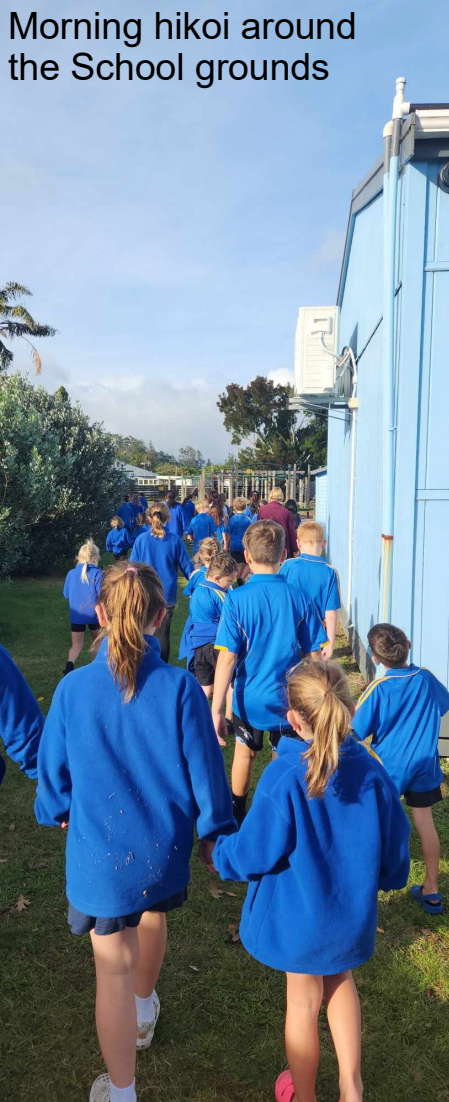
Morning hikoi around the School grounds