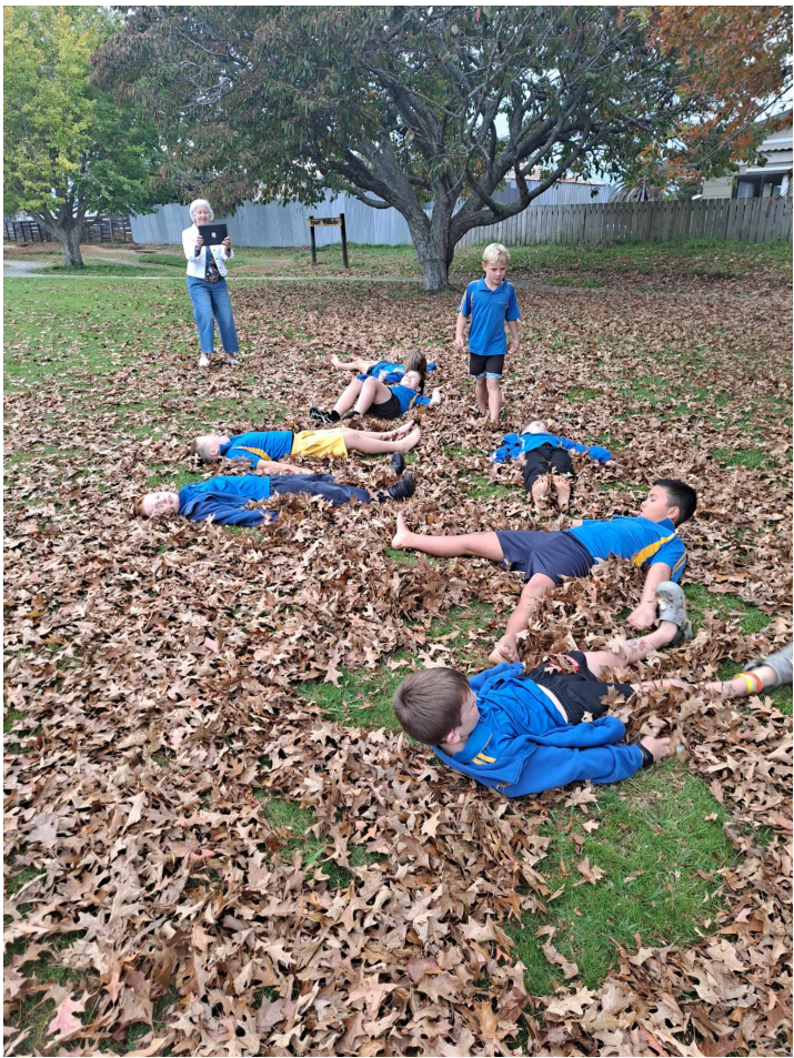
Room 3 having some autumn learning.