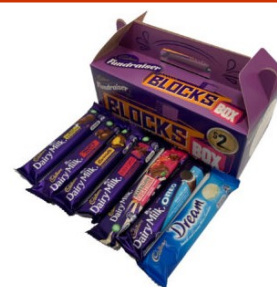
Cadbury BLOCKS BOX 36 Pack 45g – 60g $2.00 RRP x 6 Carry Packs

This Blocks Box includes the best sellers from the Cadbury Dairy Milk Range 45g-60g! At $2 these make selling easy with just one coin required!