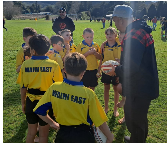
Thames Valley Rippa—congratulations to East Hurricanes who have qualified for the next round of competitions.