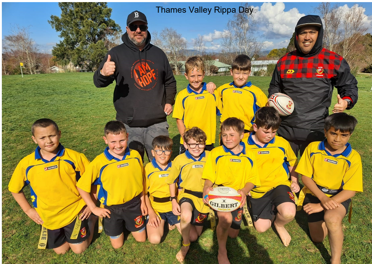
Thames Valley Rippa Day