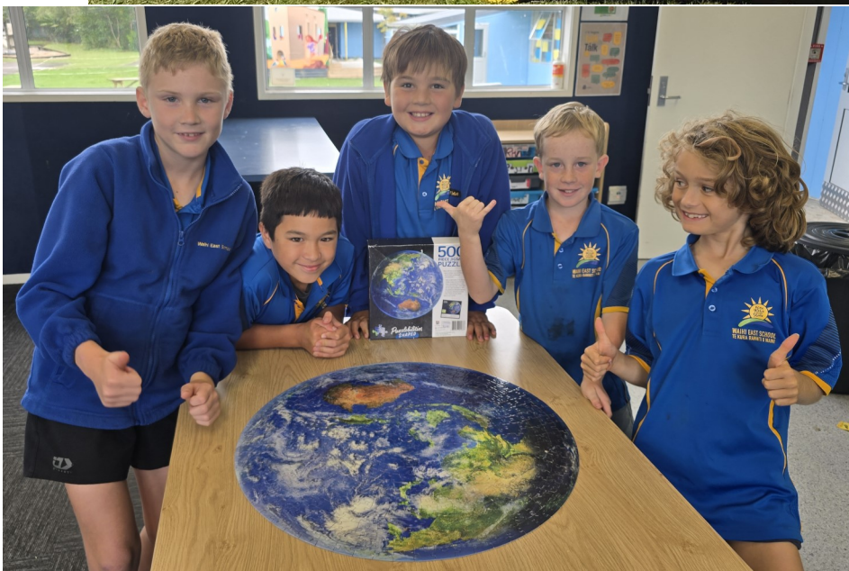
Ururangi class puzzle completed!