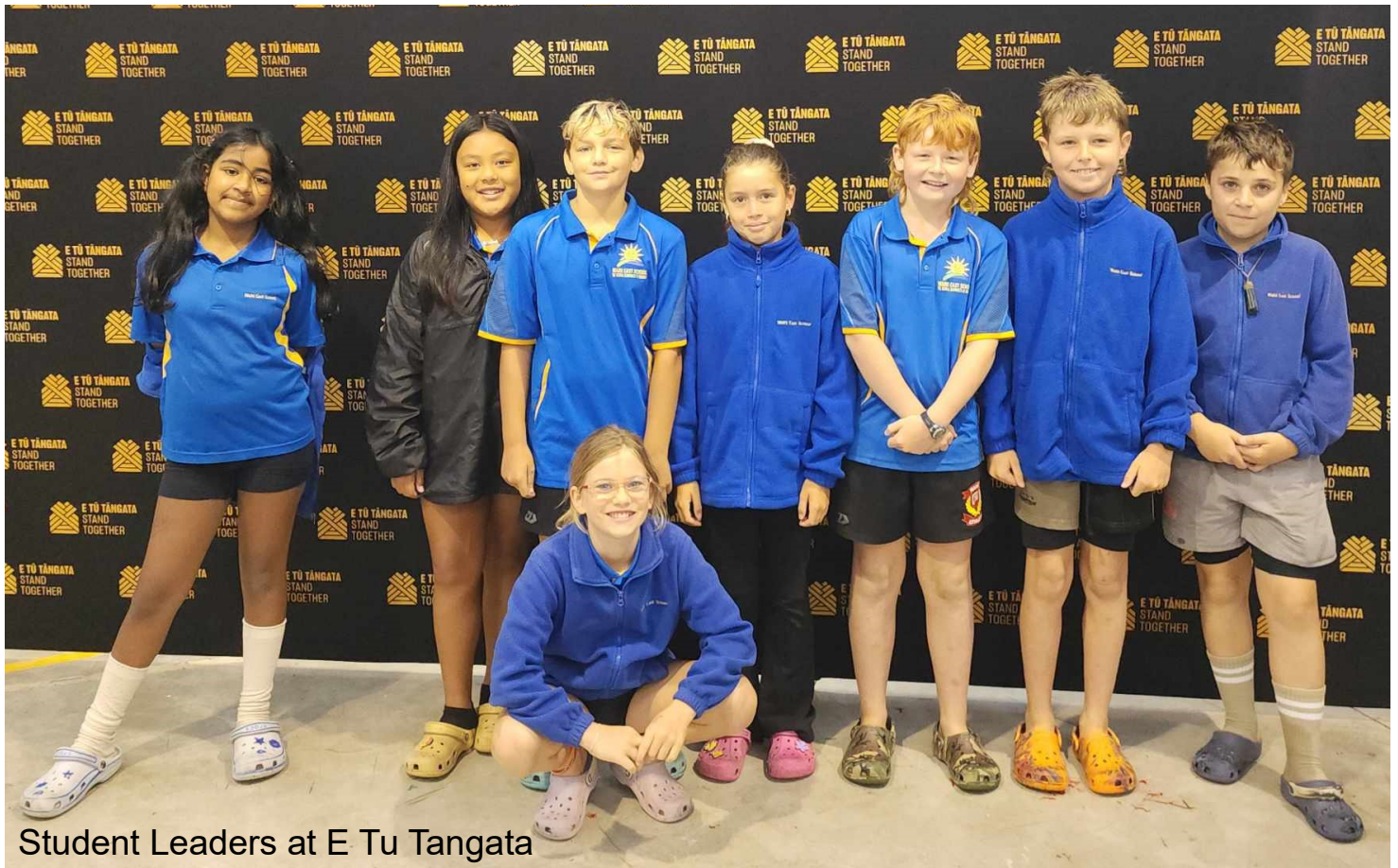
Student Leaders at E Tu Tangata