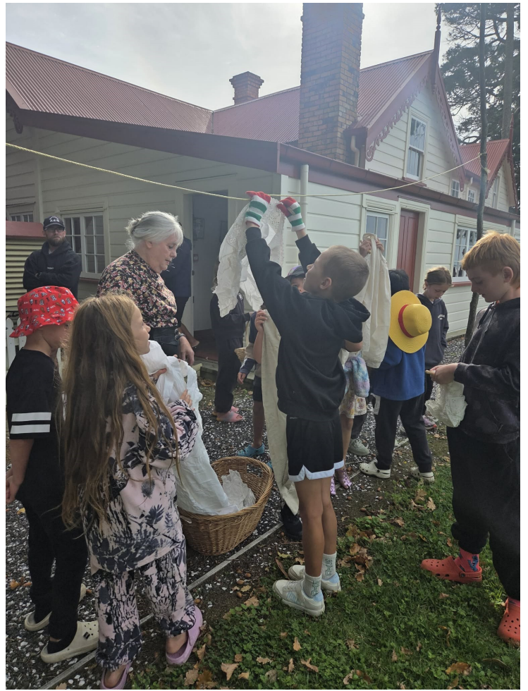
Year 3 & 4 Surf n Turf