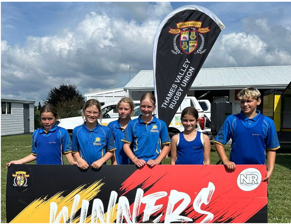
Thames Valley Preliminary Waihi Tourment for Rippa Rugby Both teams have qualified for the Thames Valley Regional Tournament in Ngatea.