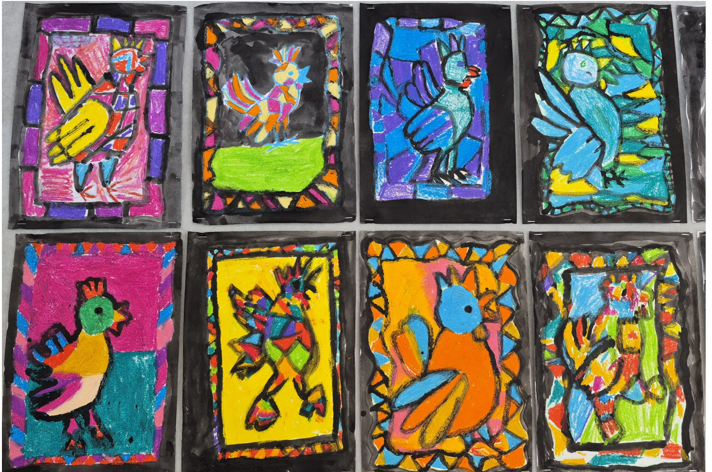
Artwork from Matariki and Hiwa-i-te-rangi