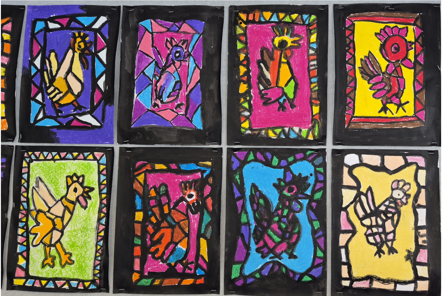
Artwork from Matariki and Hiwa-i-te-rangi