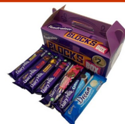
Cadbury BLOCKS BOX 36 Pack 45g – 60g $2.00 RRP x 6 Carry Packs

The bars are $2 each. There are 36 bars in each box. The whole box is worth $72.